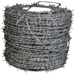
Barbed Wire: 15 1/2 Gauge