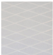
Top of String Reinforced