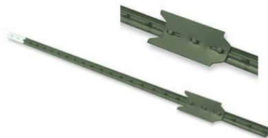
T-Posts: 6' Green 1.25#