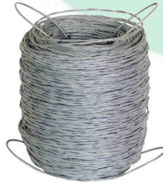
Barbless Wire: 14 AWG